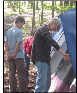
At Camp-O-Rama we stay in tents.

placed first and third in the cardboard canoe race, first in "Bible Baseball" where a "hitter" is asked a question of varying difficulties, first in Bible verse memory, second in fire building, third in the leaders division of wiffle ball, and second for "Best Overall Battalion". This year we hope to flourish in not only the competition, but also our spiritual walks with the Lord.