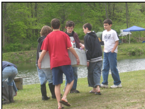
Putting the cardboard canoe into position.