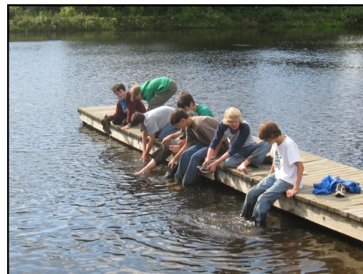
Washing off after a muddy hike.