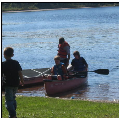
Going Canoeing at Vanderkamp.