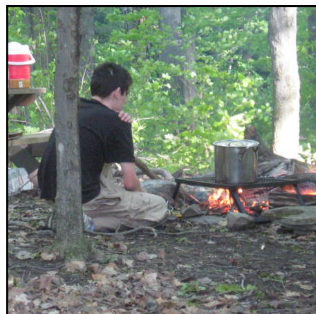
Cooking Potatoes at Camp-O-Rama.