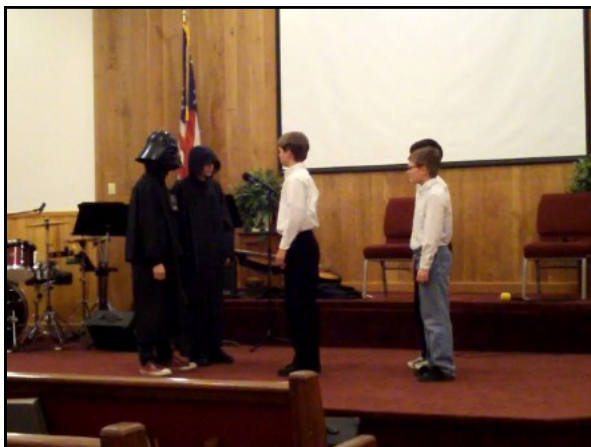
Darth Vader, the Emperor, and the servants.

"It took a lot of hard work, but it was definitely worth it."