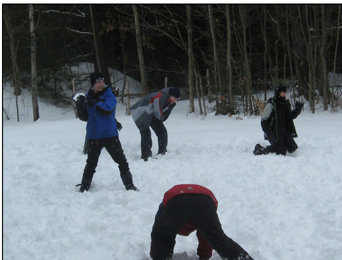
Snowball fight at the Father-Son Retreat.