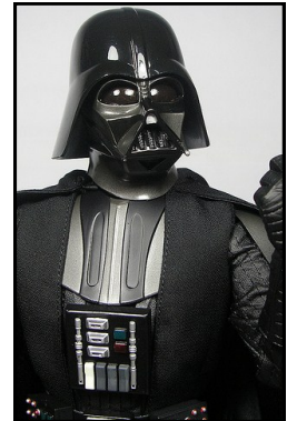
Darth Vader, one of the characters from Star Wars who also appeared in our skit.

The skit was extremely fun to perform, and the audience seemed to like it. It took a lot of hard work, but it was definitely worth it. Next spring, we plan to create another skit, even better than the first!