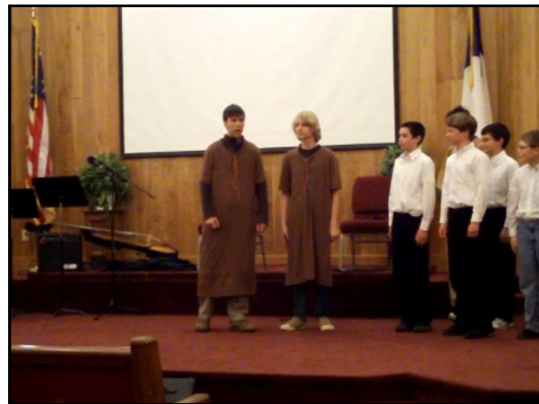
The landowner, the Son, and the servants.